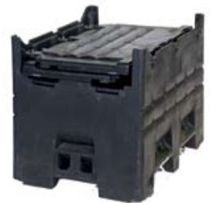
Stockbox once folded